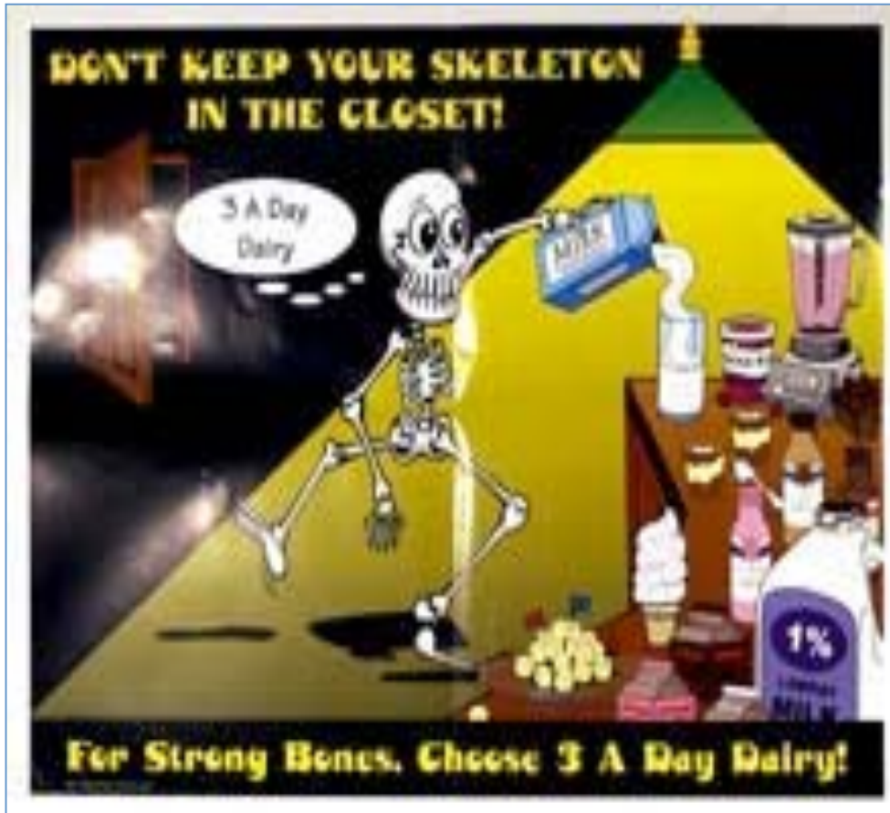
24" x 18" poster features 3-A-Day of Dairy.